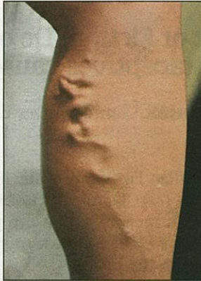
An example of abnormally dilated varicose veins. These belong to a 40-year-old Chinese woman.

They kept her up at night because they itched and caused cramps. Her legs would feel heavy and tired after she was on her feet for more than an hour.