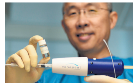
VenaSeal Closure System.

Visit The Vein Clinic and Surgery to find out more about VenaSeal Closure System.